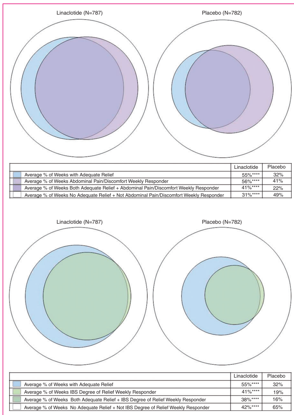
Figure 2. Within-patient agreement between weekly adequate relief and weekly EMA responder criteria. (a) Weekly abdominal pain/abdominal discomfort responder. Pooled phase 3 IBS-C ITT population, Weeks 1–12. **** p < 0.0001 for linacotide vs placebo; p values were obtained from an ANOVA model with treatment group, geographic region, and trial as factors. Agreement (average % of weeks with AR and abdominal pain/discomfort weekly responder + no AR and not abdominal pain/discomfort weekly responder) = 71.8% for linacotide and 71.2% for placebo; average % of weeks with AR and not abdominal pain/discomfort weekly responder = 13.9% for linacotide and 10.0% for placebo; average % of weeks no AR and abdominal pain/discomfort weekly responder = 14.3% for linacotide and 18.7% for placebo. (b) Weekly IBS degree of relief responder. Pooled phase 3 IBS-C ITT population, Weeks 1–12. **** p < 0.0001 for linacotide vs placebo; p values were obtained from an ANOVA model with treatment group, geographic region, and trial as factors. Agreement (average % of weeks with AR and IBS degree of relief weekly responder + no AR and not IBS degree of relief weekly responder) = 79.8% for linacotide and 81.5% for placebo; average % of weeks with AR and not IBS degree of relief weekly responder = 17.5% for linacotide and 16.0% for placebo; average % of weeks no AR and IBS degree of relief weekly responder = 2.7% for linacotide and 2.4% for placebo. EMA: European Medicines Agency; IBS-C: irritable bowel syndrome with constipation; ITT: intent to treat; ANOVA: analysis of variance; AR: adequate relief.